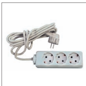
Prelungitor 230V, 10A, 3m EUR 10.00 Cod 019.010.277.000