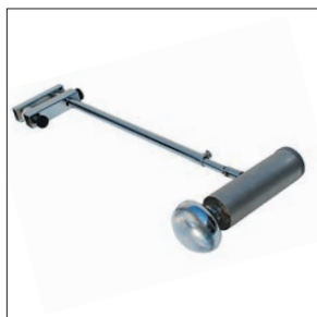
Lampa spot cu brat 100W EUR 12.00 Cod 019.010.181.000