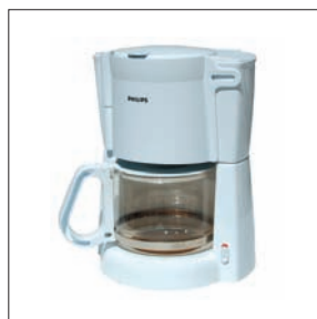
Filtru de cafea EUR 4.00 Cod 025.010.120.010