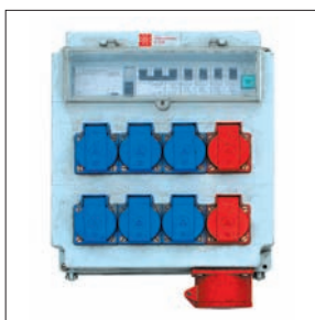
Panou Electric EUR 120.00 OCTANORM Cod 019.010.275.000