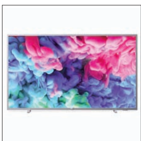
TV LED SMART 4K, EUR 40.00/zi UHD ultrasubtire (diagonala ecran: 126 cm) Cod 025 010 130 045