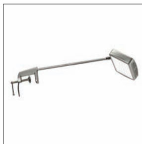
Reflector tija LED A++ EUR 35.00 16W 1100LM 4000K ARM33CM Cod 019.010.200.040