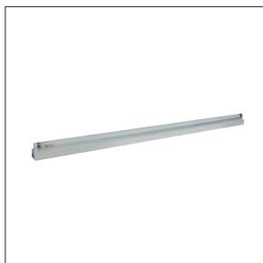
Lampa fluorescenta FIA EUR 15.00 cu instalatie electrica completa 1x40W Cod 019.010.110.000