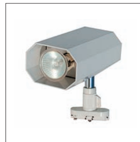
Spot halogen SY STAR 50W(A) EUR 15.00 Cod 019.010.186.000