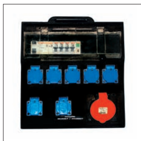
Panou Electric 380V/220V EUR 100.00 Cod 019.010.265.000