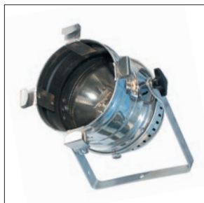
Reflector PAR64 500-1000W EUR 40.00 Cod 019.010.200.020