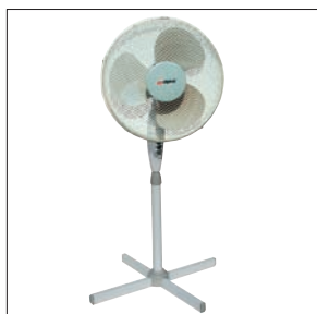
Ventilator cu picior EUR 7.00 Cod 025.010.500.020