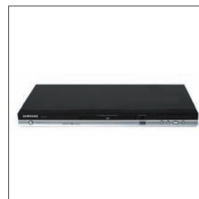
DVD Player EUR 40.00 Cod 025 010 130 030