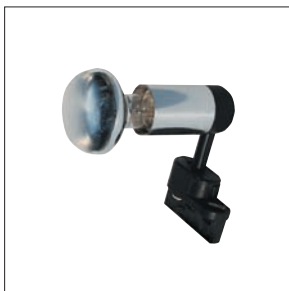
Lampa spot 100W EUR 12.00 Cod 019.010.188.000