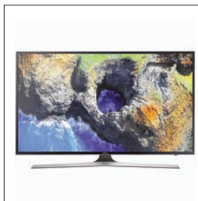
TV SAMSUNG UHD, EUR 60.00/zi (diagonala ecran: 163 cm) Cod 025 010 130 047