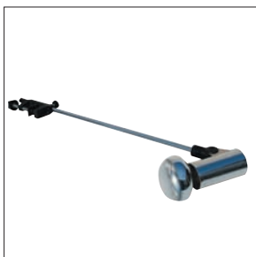
Lampa spot cu brat EUR 12.00 Cod 019.010.180.000