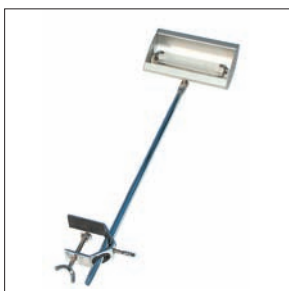
Reflector cu brat 300W EUR 35.00 Cod 019.010.200.010