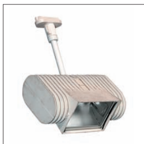
Reflector halogen SYMA STAR 300W EUR 35.00 Cod 019.010.200.006