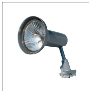
Spot halogen SY STAR 100W EUR 15.00 Cod 019.010.185.000