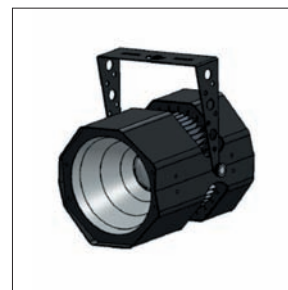
Reflector LED VIRGO EUR 40.00 40W 4350 LM 4100 K Cod 019.010.200.045