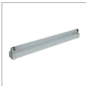
Corp fluorescent tip SS30 EUR 18.00 cu un tub D-170 - A Cod 019.010.190.001