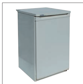
Frigider ARCTIC (180 l) EUR 44.00 Cod 025 010 070 020