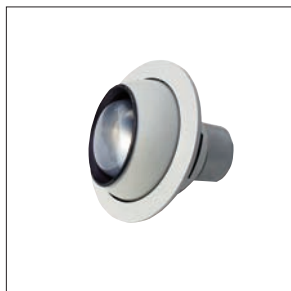
Lampa spot 100W EUR 12.00 Cod 019.010.170.000