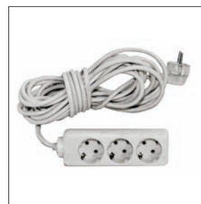
Prelungitor 230V, 10A, 5m EUR 10.00 Cod 019.010.279.000