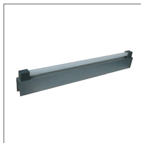
Corp fluorescent tip SS30 EUR 15.00 cu un tub D-170 Cod 019.010.190.000