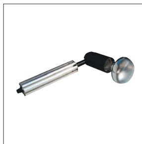
Lampa spot stut OCTANORM EUR 12.00 Cod 019.010.187.000