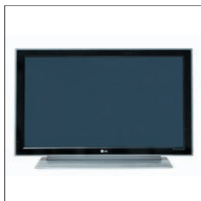
TV Plasma EUR 25.00/zi (diagonala ecran: 107 cm) Cod 025 010 130 040