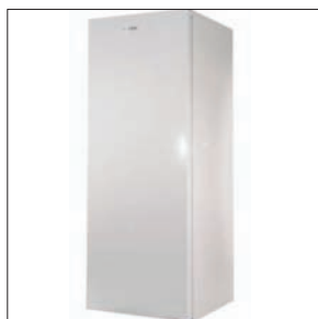
Frigider ARCTIC 255 l EUR 55.00 Cod 025 010 020 199