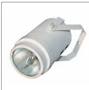
Reflector HQI 80W EUR 35.00 Cod 019.010.200.030