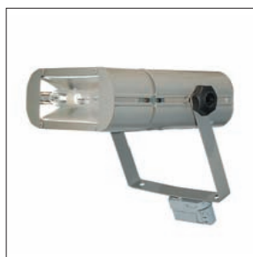
Reflector IVEN HQI 150W EUR 35.00 Cod 019.010.200.005