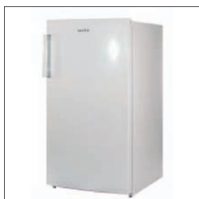
Frigider ARCTIC FB 155 EUR 25.00 Cod 025 010 020 198