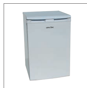
Racitor (140 l) EUR 24.00 Cod 025 010 070 010 (55 x 61 x 84 cm)