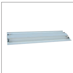
Corp fluorescent tip EUR 20.00 OCTANORM cu doua tuburi D-171 Cod 019.010.200.000