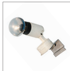
Lampa spot SS30 100W EUR 12.00 Cod 019.010.200.008