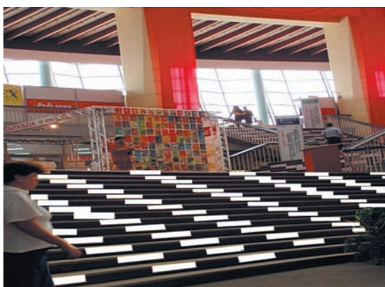
STICKERS DISPLAY ON PAVILION'S STAIRS AND FLOOR