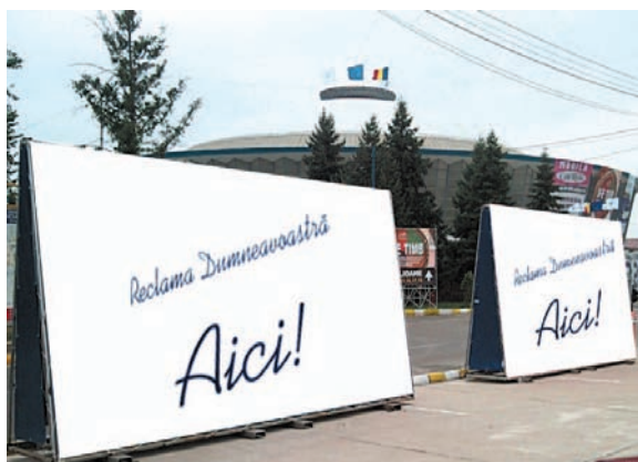
BANNER DISPLAY ON MOBILE PLATFORMS