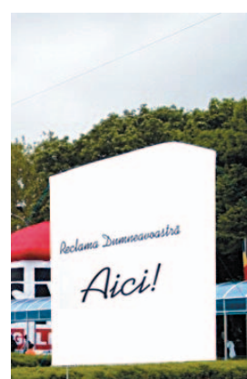
ADVERTISING MASCOTS DISPLAY