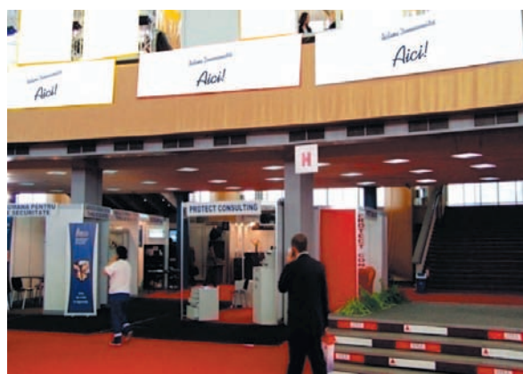
BANNER DISPLAY ON PAVILION A, FRIEZE 4.50