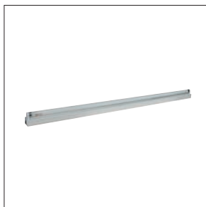
Lampa fluorescenta FIA EUR 15.00 cu instalatie electrica completa 1x40W Cod 019.010.110.000