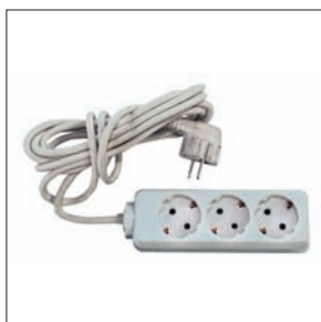
Prelungitor 230V, 10A, 3m EUR 10.00 Cod 019.010.277.000