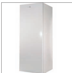
Frigider ARCTIC 255 l EUR 55.00 Cod 025 010 020 199