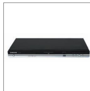
DVD Player EUR 40.00 Cod 025 010 130 030