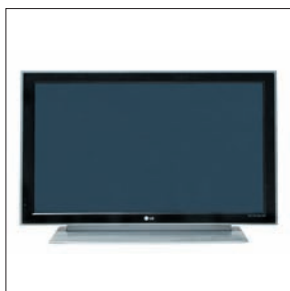
TV Plasma EUR 25.00/zi (diagonala ecran: 107 cm) Cod 025 010 130 040