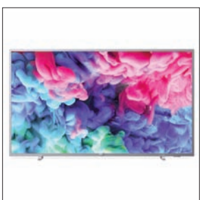
TV LED SMART 4K, EUR 40.00/zi UHD ultrasubtire (diagonala ecran: 126 cm) Cod 025 010 130 045