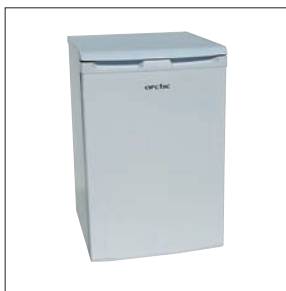
Racitor (140 l) EUR 24.00 Cod 025 010 070 010 (55 x 61 x 84 cm)