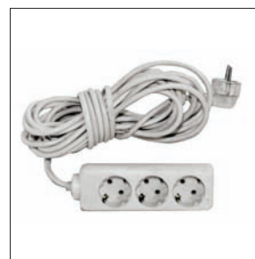
Prelungitor 230V, 10A, 5m EUR 10.00 Cod 019.010.279.000