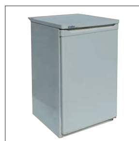
Frigider ARCTIC (180 l) EUR 44.00 Cod 025 010 070 020