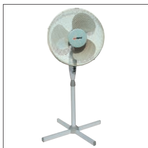
Ventilator cu picior EUR 7.00 Cod 025.010.500.020