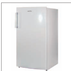
Frigider ARCTIC FB 155 EUR 25.00 Cod 025 010 020 198