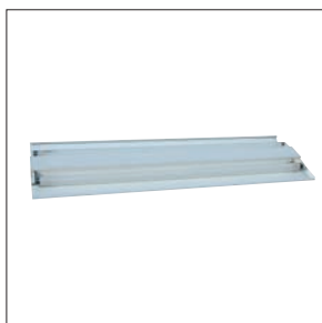
Corp fluorescent tip EUR 20.00 OCTANORM cu doua tuburi D-171 Cod 019.010.200.000