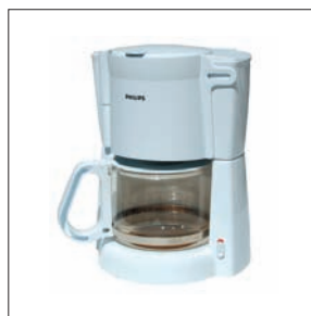
Filtru de cafea EUR 4.00 Cod 025.010.120.010