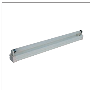
Corp fluorescent tip SS30 EUR 18.00 cu un tub D-170 - A Cod 019.010.190.001