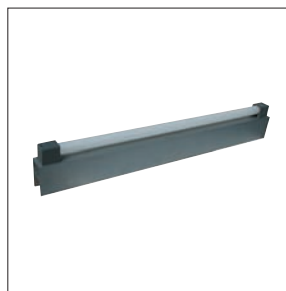
Corp fluorescent tip SS30 EUR 15.00 cu un tub D-170 Cod 019.010.190.000